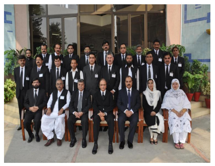
Hon'ble Mr. Justice Tassaduq Hussain Jillani (CJEI Fellow 2010), Senior Puisne Judge, Supreme Court of Pakistan/Judge In charge (Academics), FJA (first row center) with Judicial Officers at FJA

were having a judicial education group to discuss the emerging issues of this field. The Academy is actively participating in every such activity to raise the standard of judicial education in Pakistan. The Hon'ble Chief Justice of Pakistan always takes keen interest in the activities of the Academy and for that matter Hon'ble Mr. Justice Tassaduq Hussain Jillani (CJEI Fellow 2010), Judge, Supreme Court of Pakistan/Judge Incharge (Academics) and Mr. Justice Nasir-ul-Mulk (CJEI Fellow 1999), Judge, Supreme Court of Pakistan/Judge