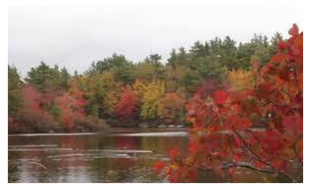
Nova Scotia in the Fall

Fall Greetings! To me this is the most beautiful time of the year in Nova Scotia with the deciduous tree foliage turning glorious orange and crimson red colours against the dark green conifers. I wish you could all be here with me to see the spectacle. It uplifts the heart.