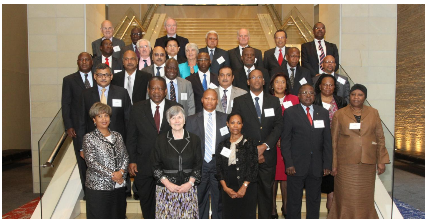
Chief Justices and Justices in Attendance