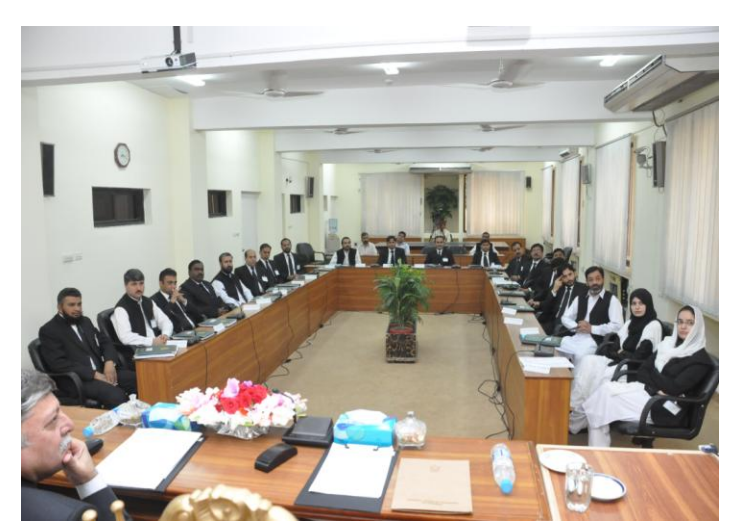
Internal view of Federal Judicial Academy Classroom

and two workshops/seminars in collaboration with UNDP and British High Commission. With the special